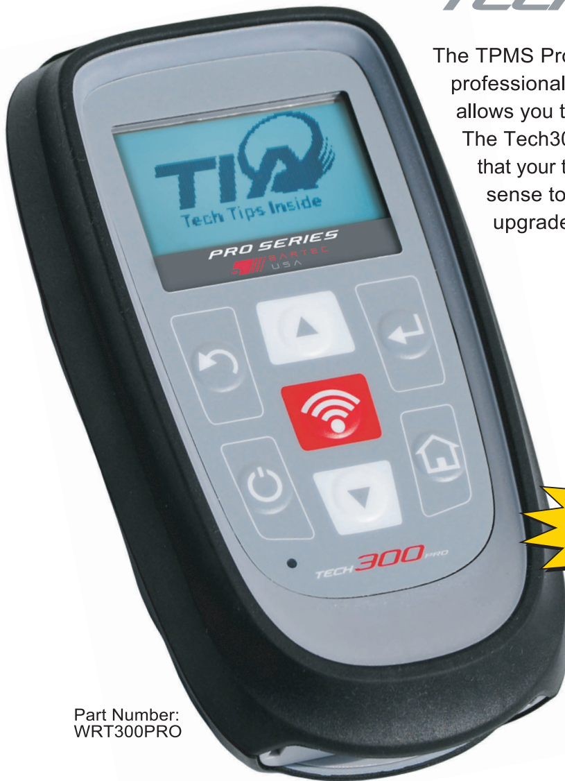
Part Number: WRT300PRO

The TPMS Pro Series tools are designed for the automotive service professional. The Tech300Pro is the entry-level TPMS tool that allows you to grow TPMS service at the pace of your business. The Tech300Pro is an activation-only tool that has loads of features that your typical activation-only tool doesn't have. When it makes sense to upgrade your service capability, the Tech300Pro upgrades to a TPMS OBD Tool!