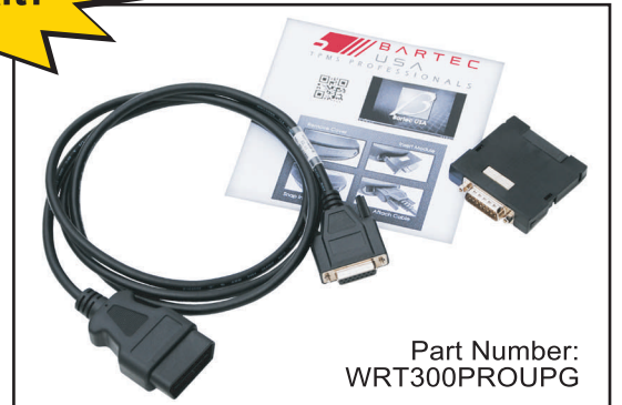
Part Number: WRT300PROUPG